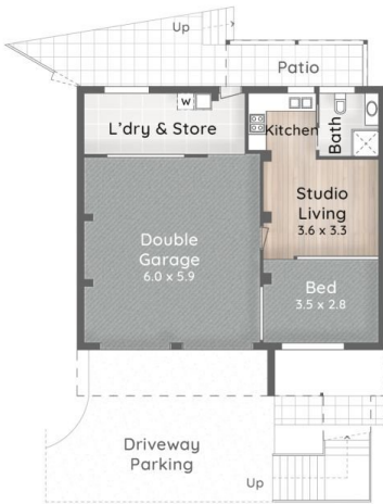
:: FLOOR PLAN Lower Floor - Ceiling 2.5m