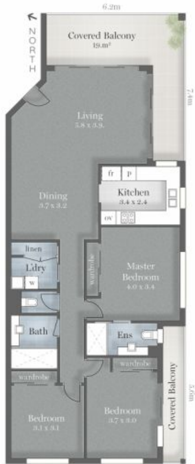
:: FLOOR PLAN Level 1